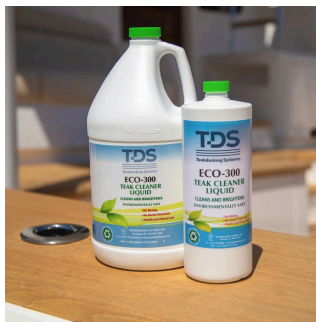
Teak Cleaner Liquid ECO-300