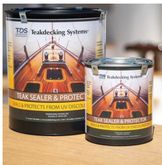
Teak Sealer & Protect