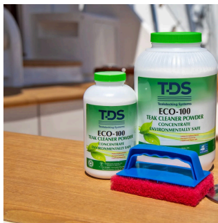
Teak Cleaner Powder ECO-100